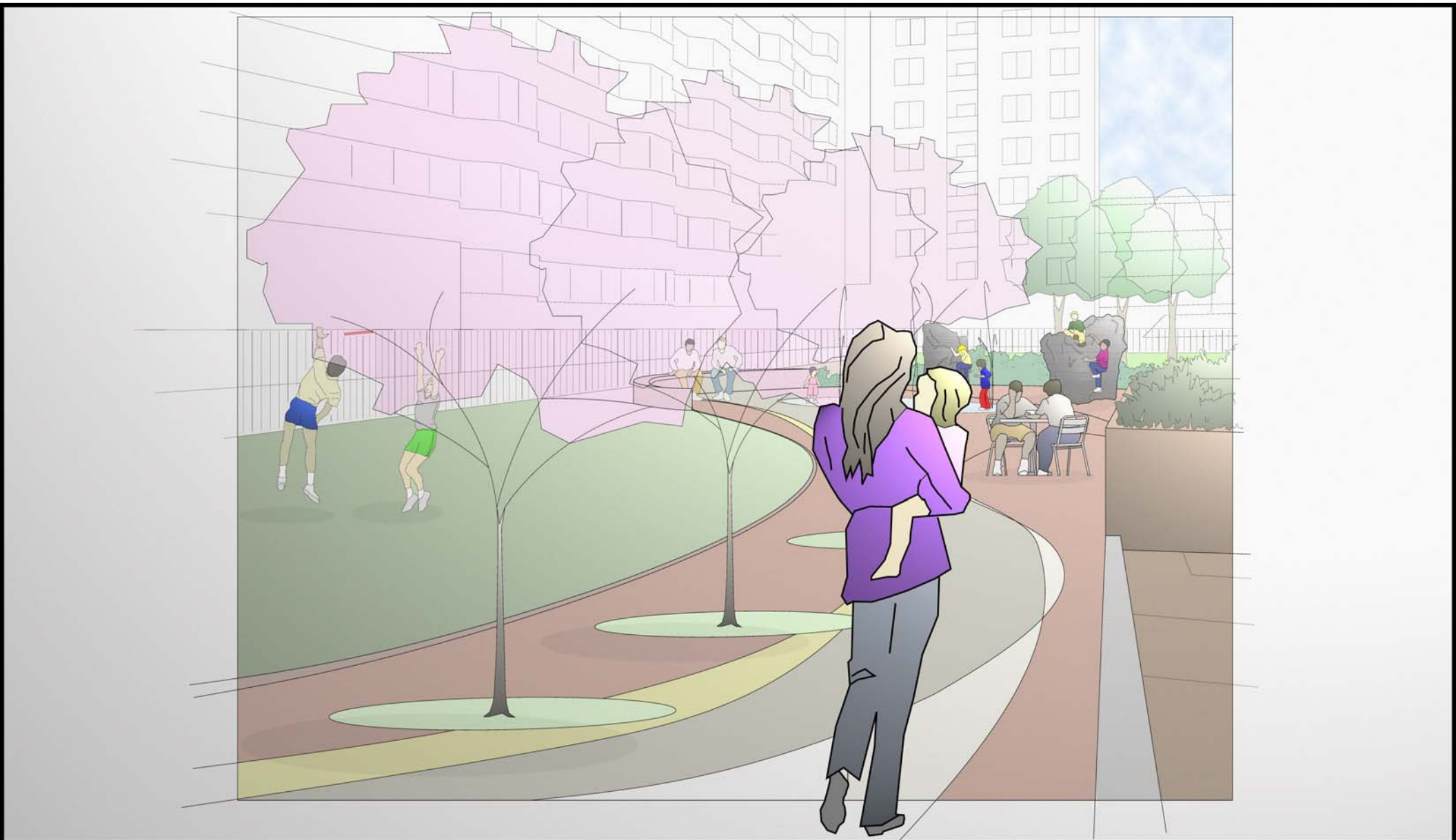
PERSPECTIVE, VIEW INTO PARK FROM 10TH STREET

10TH STREET PARK, NW, WASHINGTON, D.C. CONCEPTUAL DESIGN / ILLUSTRATIVE DRAWING