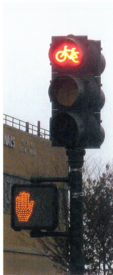
Figure 8 - Bicycle Signal