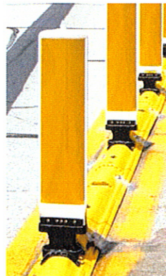
Figure 2 - Temporary Curb (items 9 and 10)