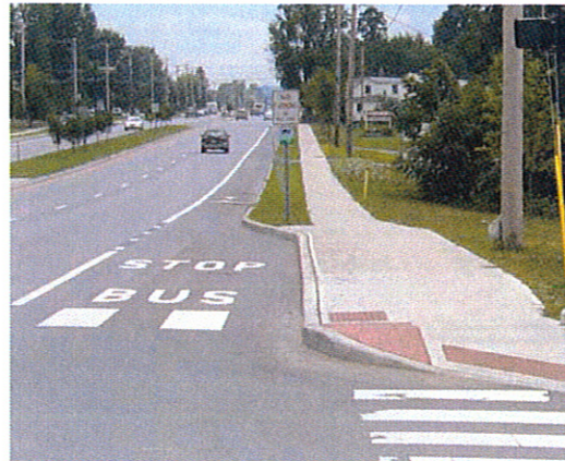
Figure 6 - Shared Bus Stop/Cycle Track