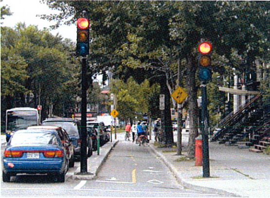
Figure 3 - Curb Separation (item 11, 13 or 14)