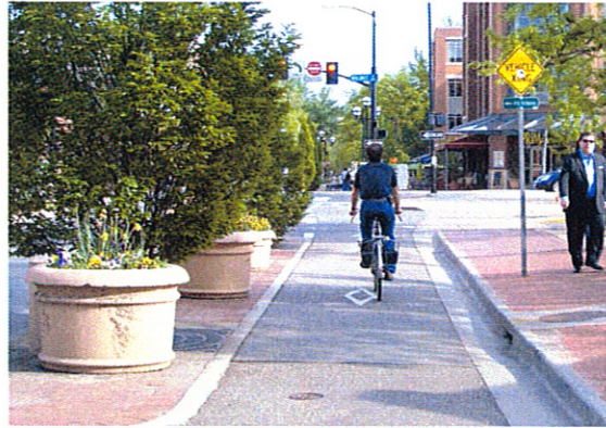
Figure 4 - Planter Separation (item 12)

The following table details the estimated costs for each method of separation: