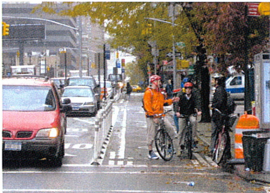
Figure 1 - Flex Post Separation (item 8)

A range of options is shown below for consideration.