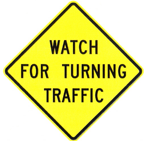
Figure 9 - Warning Sign

This design option utilizes a surface mounted concrete curb (with drilled rebar posts) to separate the cycle track from motor vehicle traffic. Flexible posts are mounted to the concrete and are spaced at 30 foot intervals. Traffic signs recommended are installed at all intersections, a solid pavement marking stripe is located between the outside motor vehicle lane and the flex posts. Bicycle symbols are installed in the cycle track and at all vehicle crossing locations. All bus stops are consolidated and moved to the far sides of intersections as recommended without the construction of concrete bus pads. Concrete curb