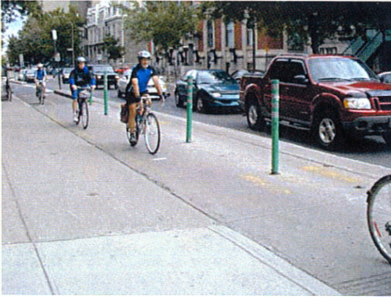
Figure 5 - Curb Extended Bus Stop