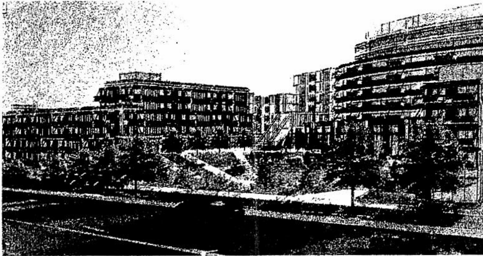
County Staff concept drawing of EFC Metro Site