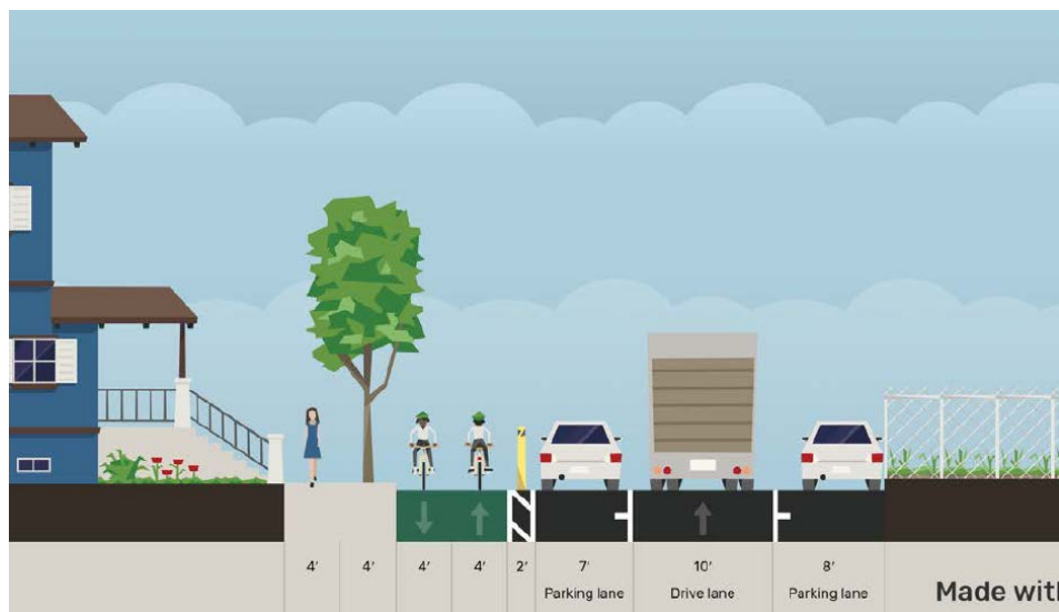
Figure 2 Proposed Condition — Typical 8 th Street NE Cross Section